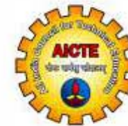
AICTE (All India Council for Technical Education, New Delhi)